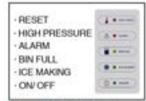
Auto-alert Indicator Lights