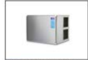
T304 Stainless Steel Panels