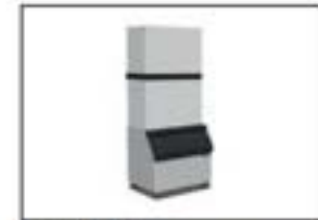
Double Stack (Needs a stacking kit sold separately)