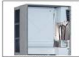
Vertical Cube System