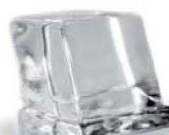
Full Cube - 12 G (26,5 x 26,5 x 26 mm)