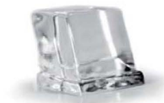
Full Cube - 12 G (26,5 x 26,5 x 26 mm)